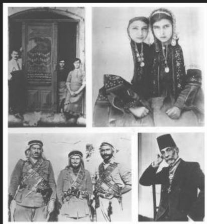
A PHOTOGRAPHIC HISTORY OF THE PALESTINIANS 1876-1948