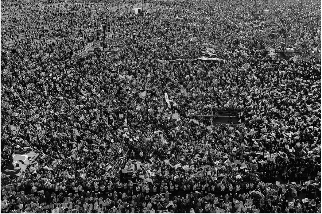
Protesters waving Turkish and Palestinian flags attend a solidarity demonstration in Istanbul protesting Israeli measures at Haram al-Sharif in Jerusalem. (30 July)

Qatari state media that praised Iran, Hamas, and Israel. “Iran represents a regional and Islamic power that cannot be ignored and it is unwise to face [ sic ] up against it,” al-Thani was quoted as saying; he then allegedly characterized Qatar’s relations with Israel as “good,” described Hamas as the official representative of the Palestinian people, and said Doha had “tensions” with the Trump admin. The comments were unusual for al-Thani, who was under renewed pressure from Saudi Arabia and the U.S. to end Qatar’s relationships with Hamas and the Muslim Brotherhood (see “Saudi Arabia” below).