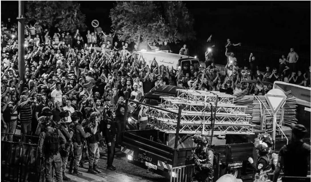
After more than a week of protests and boycotts, Palestinians celebrate the removal of metal detectors and barriers at some of the entrances to Haram al-Sharif. (27 July, Ahmad Gharabli/AFP/Getty Images)

exchange for incorporating key settlement blocs into Israel. Lieberman, who has been advocating such transfers for years, tweeted (7/27), “Mr. PM, welcome to the club.” That same day, Netanyahu came out in favor of the death penalty for a Palestinian who killed 3 Israeli settlers at Halamish on 7/21 (see Chronology for details). “He should simply not smile anymore,” Netanyahu said. He also defended his handling of the Haram Al-Sharif crisis to his cabinet on 7/30: “I must make decisions coolly and judiciously. I do that out of a view of the big picture, a wide view of the challenges and threats that are facing us. Some of them are not known to the public and as is the nature of things, I can’t go into details.”