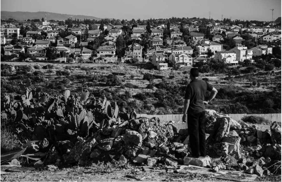
A man gazes across the distant separation wall at the Israeli settlement of Hashmonaim, west of Ramallah. (19 June, Abbas Momani/AFP/Getty Images)

(7/12) to temporarily suspend the Qalqiliya expansion plan.