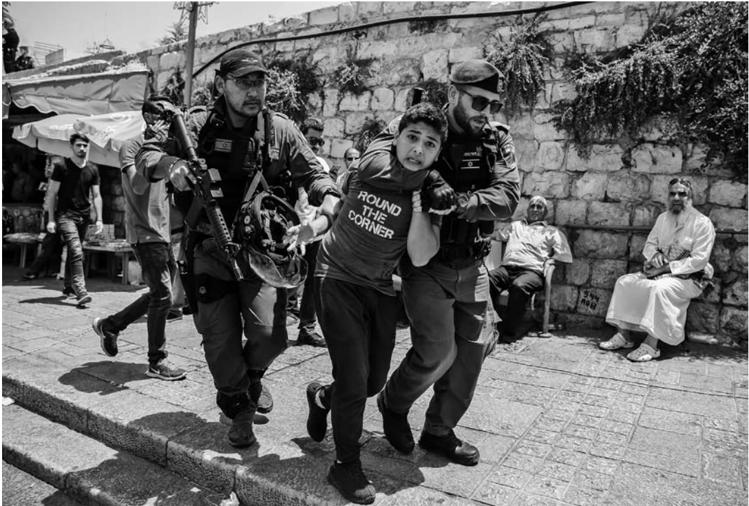
Israeli border police in Jerusalem haul away a young boy during demonstrations outside Lion's Gate in the Old City. (17 July, Ahmad Gharabli/AFP/Getty Images)

reported opposition from Israel's Shin Bet and other security services. According to a Palestinian official (7/19), the U.S., Jordan, and Saudi Arabia also began pressuring Israel to remove the metal detectors.